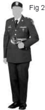
Position of Attention with Bugle

If at a service where the casket has not yet arrived , the Bugler will be at the " Rest " position until the hearse comes to a halt. ( Ceremonial Rest position is used for the HLHG ). When the door of the hearse is opened, the Bugler comes to the position of " Attention ". The Bugler positions the bugle horizontally between the left arm and body, with the bell pointed forward and the left hand gripping the front tubing of the bugle and assumes the position of " Attention ".