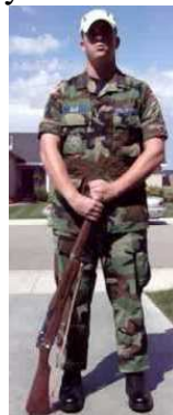
Ceremonial At Ease

When given the command " REST " or " AT EASE " the riflemen will assume a Ceremonial " AT EASE " position. Bring both hands, along with the rifle to the front center line of the body centering the weapon on its "toe" approximately 90-degrees counterclockwise. The sling should be facing to the left. Simultaneously the right hand slides up the hand guard just under the front sight post. Simultaneously the left hand comes across the body, gripping the weapon just above the right hand. Weapon remains "toed" and in-line with the right foot. Shoulders will be rolled back, knees slightly bent, and the weapon is approximately a fist or four inches away from the body. Maintain silence and immobility.