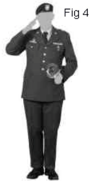
Present, Arms with Bugle