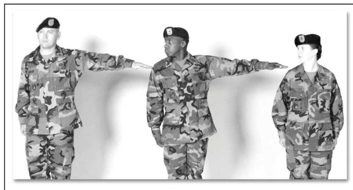
Dress Right, DRESS

Upon the command " Dress Right, DRESS " the right flank member stands fast. Each member, except the right flank member, turns his(her) head and eyes to the right and aligns him(her)self with the member on his(her) right. Each member, except the left flank member, extends his(her) left arm laterally at shoulder level, elbow locked, fingers and thumb extended and joined, palm facing down. He(she) ensures his(her) left arm is in line with his(her) body and positions him(her)self by short steps right or left until his(her) right shoulder touches the fingertips of the member on his(her) right. On the command of " Ready, FRONT ", each member returns sharply to the position of " Attention ".