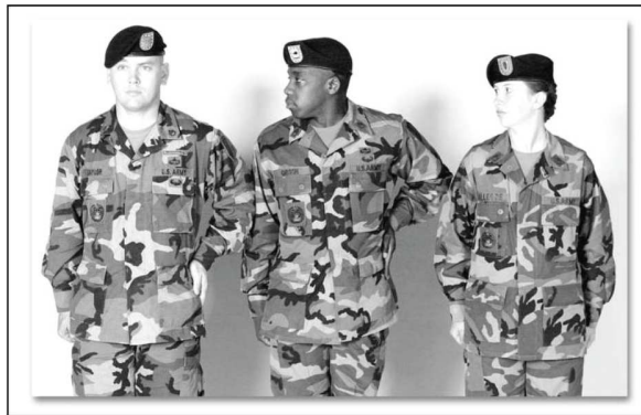
At Close Interval, Dress Right, DRESS

If given the command " At Close Interval, Dress Right, DRESS ", movements are the same as in " Dress Right, DRESS " except members place the heel of the left hand on the left hip even with the waist, fingers and thumb joined and extended downward, and with the elbow in line with the body and touching the arm of the member to the left.