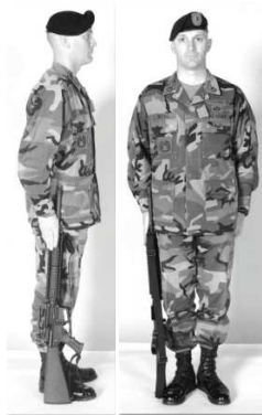
Position of Attention

The Rifle Squad will be placed upon direction from the HLHG Commander. The Riflemen will form a single file rank in the designated area and take all commands from the Rifle Commander. Upon the command " Detail, ATTENTION " come to the position of attention. Place the butt of the rifle on the marching surface, centered on the right foot, with sights to the rear. The toe of the butt touches the foot so that the front and rear sights form a straight line to the rear. Secure the rifle with the right hand in a "U" formed by the fingers (extended and joined) and thumb. Hold the rifle above the front sight assembly with the right thumb and forefinger pointed downward. Keep the right hand and arm behind the rifle so that the thumb is straight along the seam of the trouser leg.