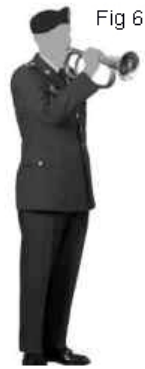
Play Position with Bugle

At the conclusion of "Taps" the Bugler returns to the position of " Attention " and then " Rest ". It is at this time the Bugler turns off the bugle insert.